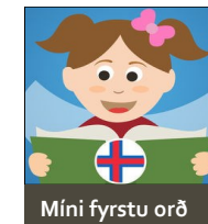
Míni fyrstu orð

Apps: "Míni fyrstu orð", "Telja" og "Ljóðbók"